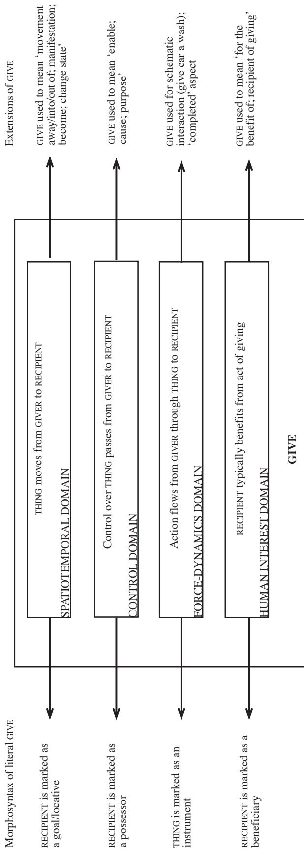
Figure 1. The common experiential grounding of literal and figurative uses of 'give'